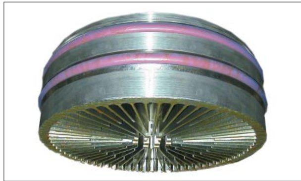
High melt rate capacity drum