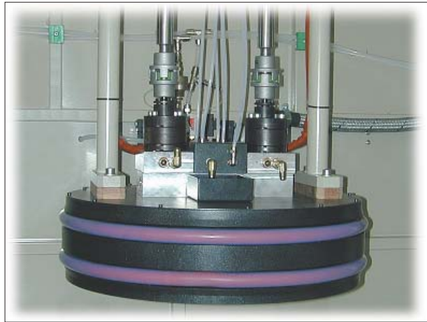
Each gear pump provided with independent by pass